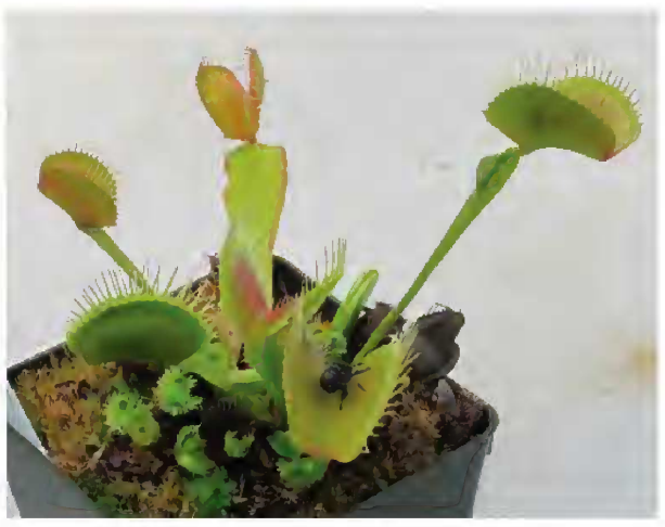
Figure 7: A flask of tissue cultured plants showing the fuzzy traps (left); mature Dionaea 'Cheerleader' plant with normal traps and new fuzzy traps on rhizome offshoots (right).

In late April 2012, this larger specimen with normal looking traps had developed additional offshoots with the distinctive "fuzzy" traps (Fig. 7). This is the typical growth behavior of Dionaea 'Cheerleader' – that is, fuzzy traps appear each spring as the plant emerges from dormancy and new offshoots develop. These fuzzy traps do not grow into normal traps, but eventually die, while, as the season progresses, additional newly emerging traps grow into normal traps. This leads me to believe that the genes responsible for the "fuzzy" traps are present and for some reason get "switched off" when the plant reaches a certain size, age, or stage of development, but can be re-activated in new young offshoots, divisions, leaf pullings, or in young plantlets propagated through tissue culture. The annual recurrent pattern of fuzzy traps in mature plants of this cultivar has been replicated by several growers.